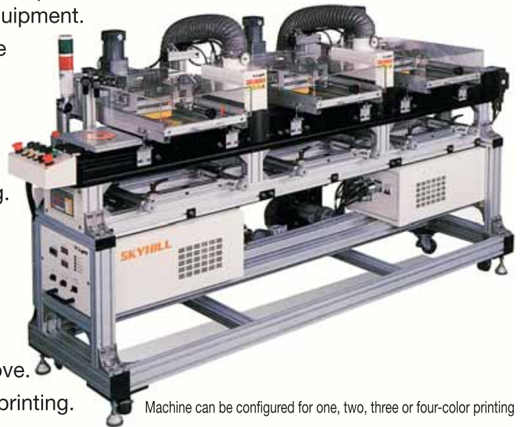
Machine can be configured for one, two, three or four-color printing